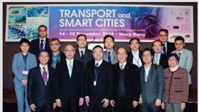
Board members of the HKSTS