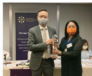
Enterprise Award: Kerry Logistics

"While we are deeply honoured to receive the prestigious CILT Award, we also feel a sense of responsibility and pride in our job as a logistics service provider, at a time when the global supply chain is facing unprecedented chaos."