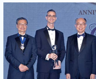
SME Award: Worldwide Cruise Terminals

"This award is a further testament to the amazing efforts DKSH continue to put in to make our supply chain operations be on par with the world's best in terms of processes, systems and facilities."