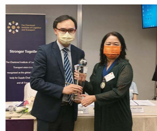
SME Award: Janco Global Logistics Ltd.

"While we are deeply honoured to receive the prestigious CILT Award, we also feel a sense of responsibility and pride in our job as a logistics service provider, at a time when the global supply chain is facing unprecedented chaos."